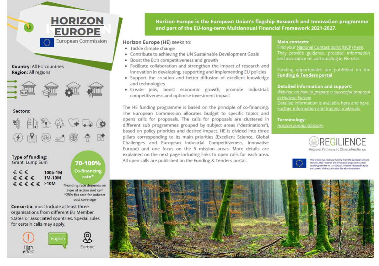
Figure 5. REGILIENCE funding opportunities - example Horizon Europe p.1