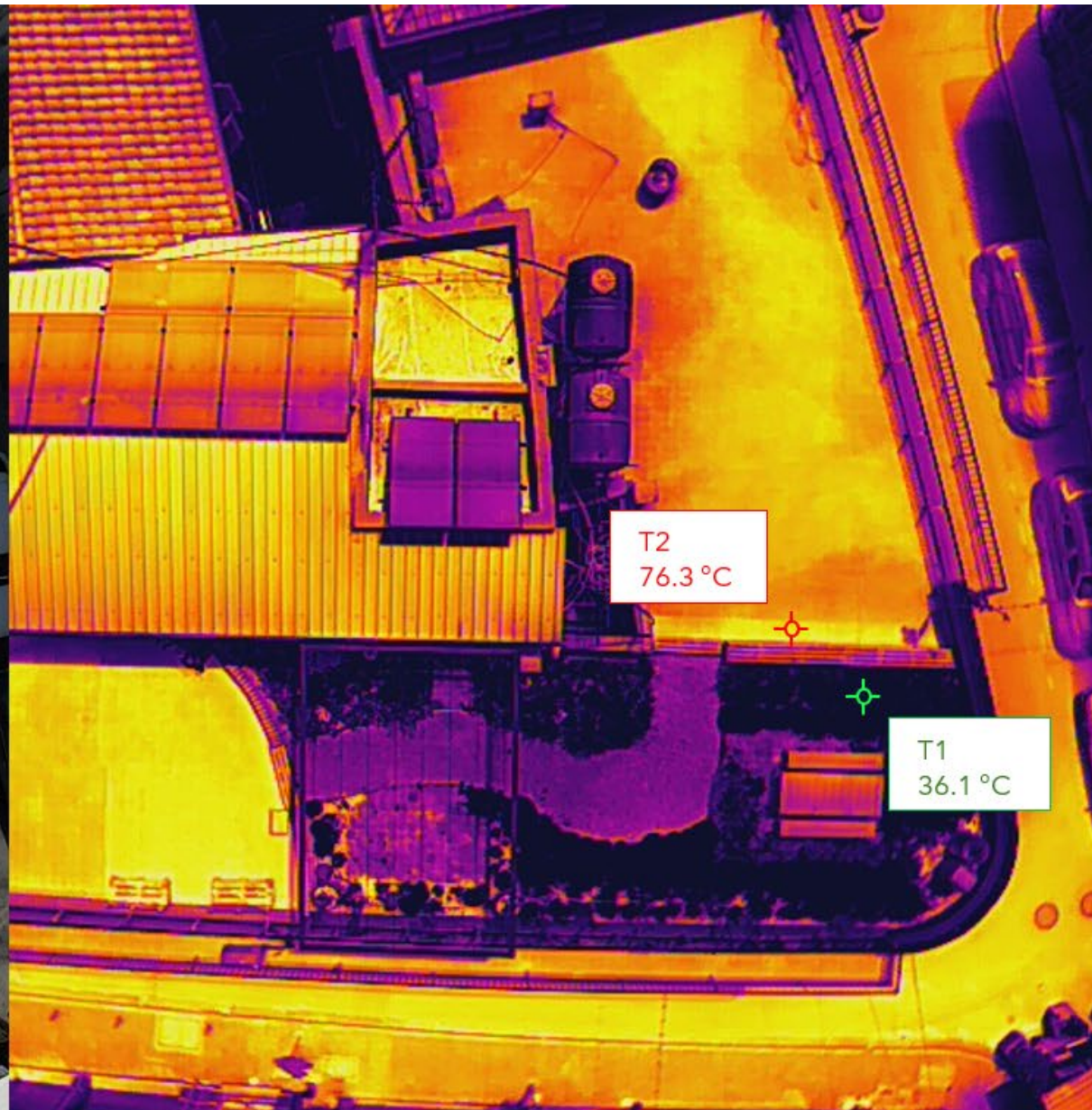
40°C temperature difference thanks to Nature Based Solutions