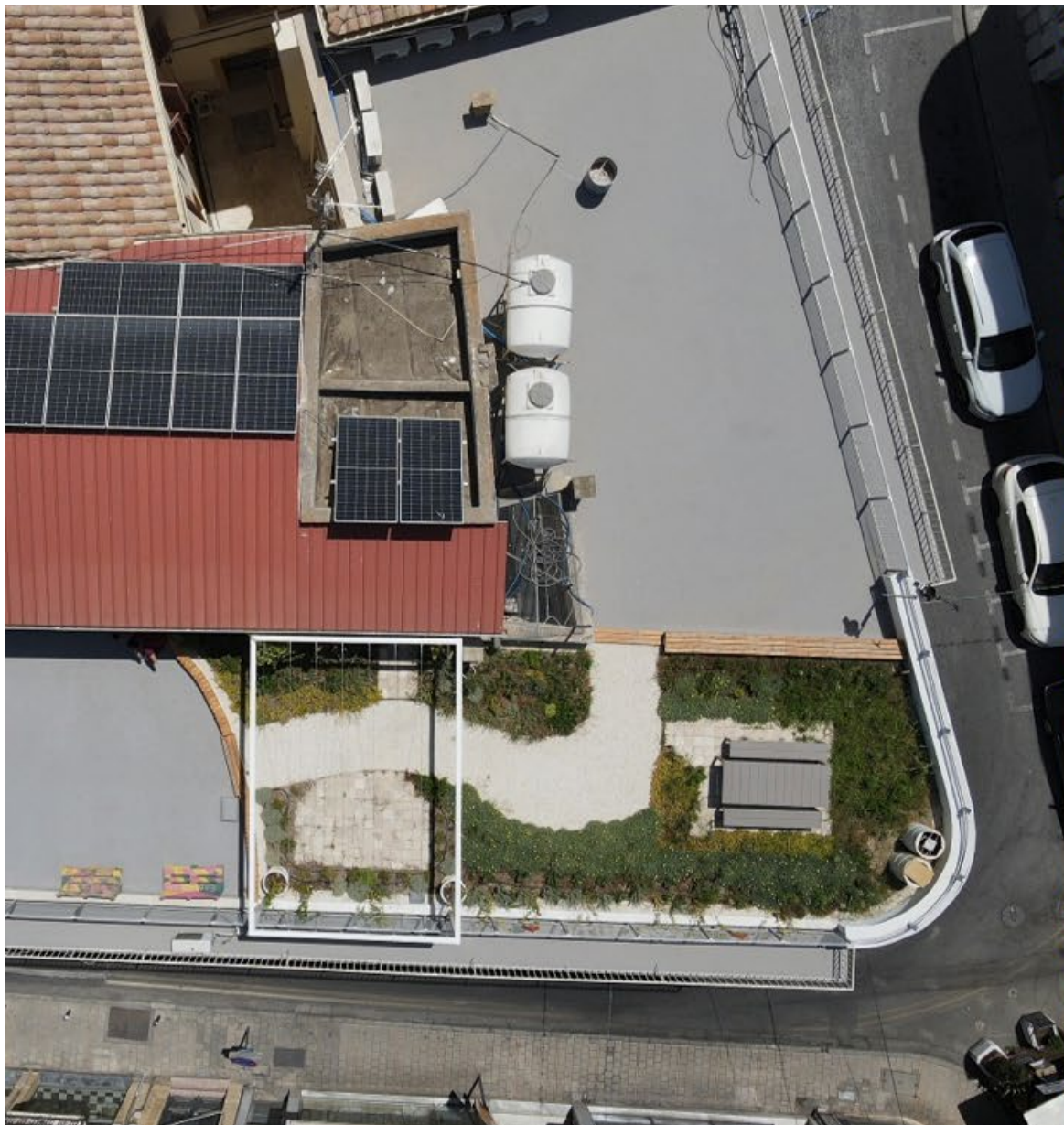
The picture was taken on 6/6/2024 at noon, on the green roof of the Cyprus Energy Agency with an air temperature of 41°C.