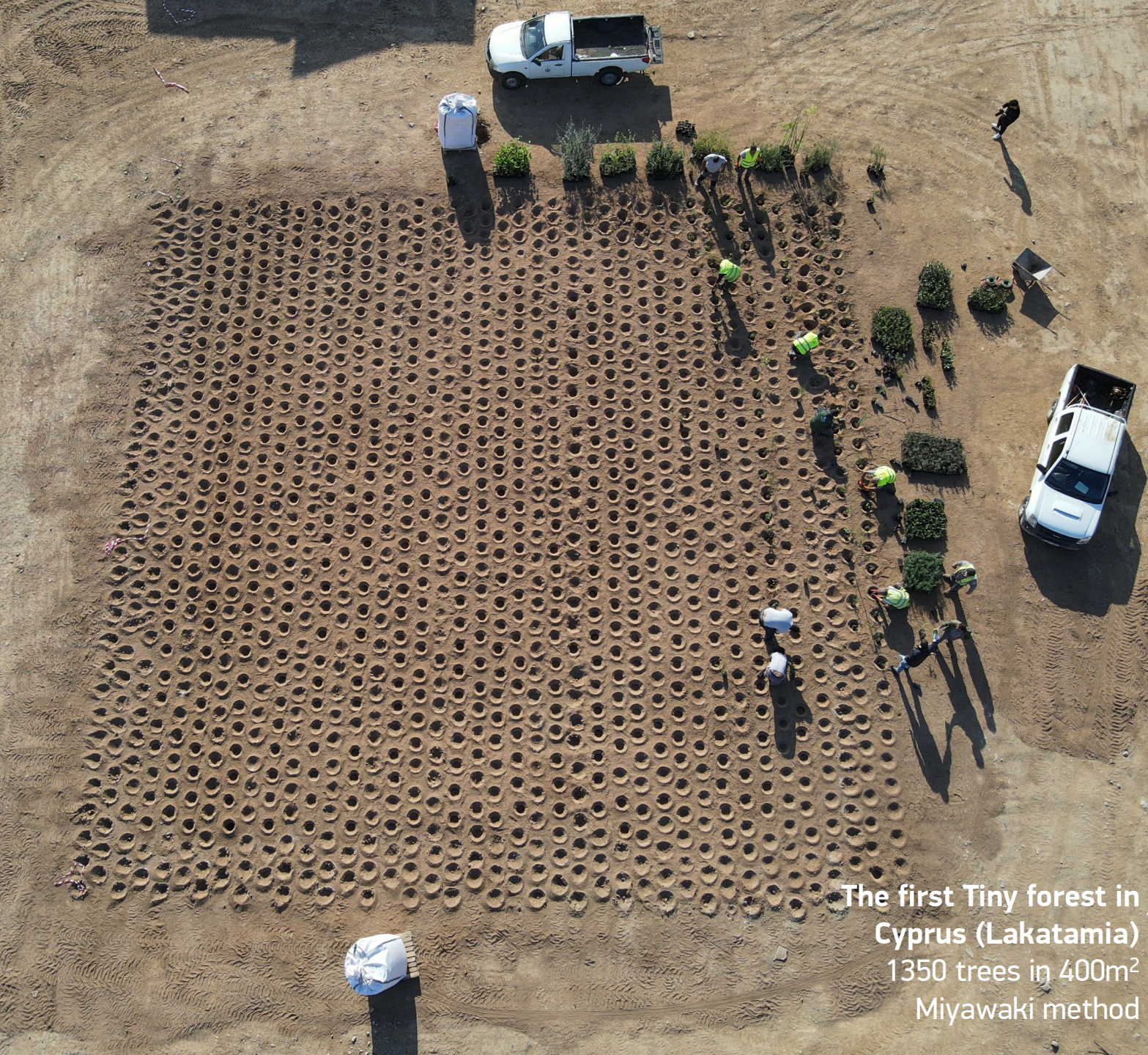
The first Tiny forest in Cyprus (Lakatamia) 1350 trees in 400m 2 Miyawaki method